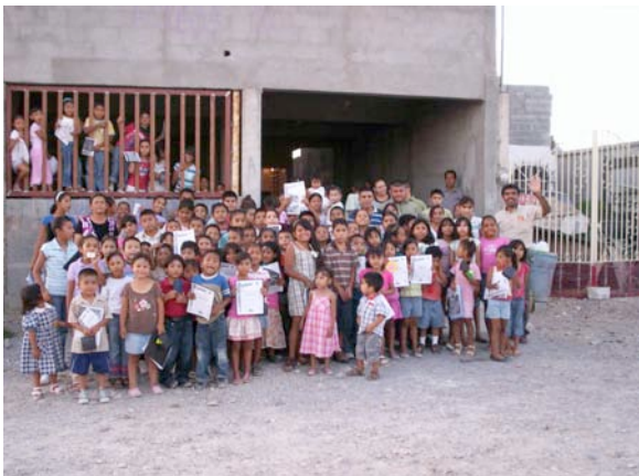
A successful VBS program.