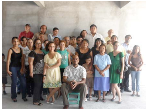
Our church family at Iglesia de Cristo, Nuevo Laredo.

Your prayers and financial support are vital to carry out our tasks of planting churches among unreached people groups; providing resources to our mission partners; and recruiting people to join mission trips. If you wish to partner with this ministry, please send your gifts payable to Bring Good News, c/o South Nassau Christian Church, 3147 Eastern Parkway, NY 11510 (a 501-C-3 non-profit organization). May His grace and peace be with you.