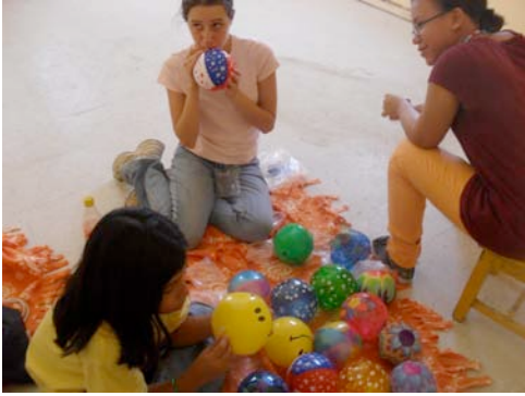
Preparing for 100 + kids that attended VBS.